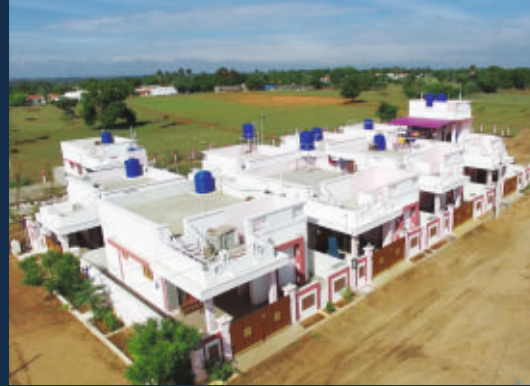
SURABHI GARDEN, KANIYAMPONDI