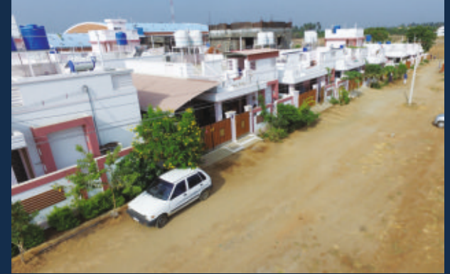
MAHALAKSHMI AVENUE, KANIYAMPONDI