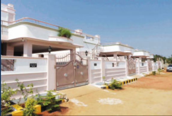
MAHALAKSHMI NAGAR, AVINASHI