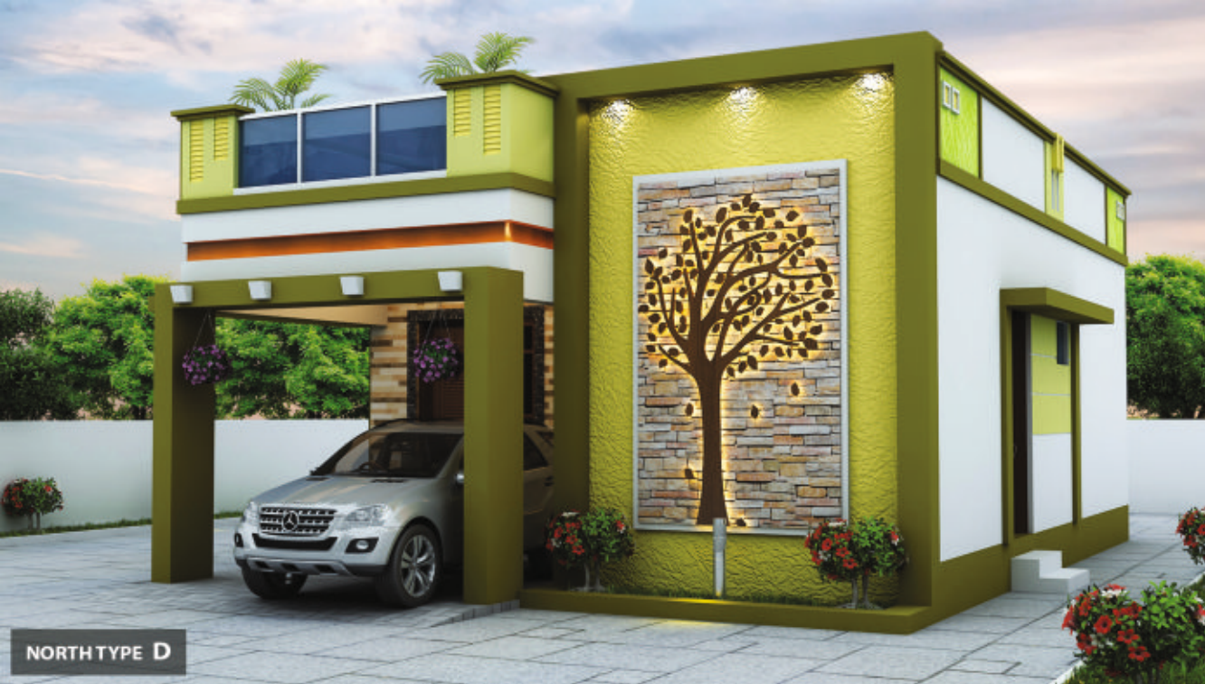
NORTH TYPE D